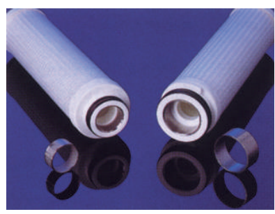
Stainless Steel Inserts

Efficiency, flow capability and service life are similar for all available constructions.